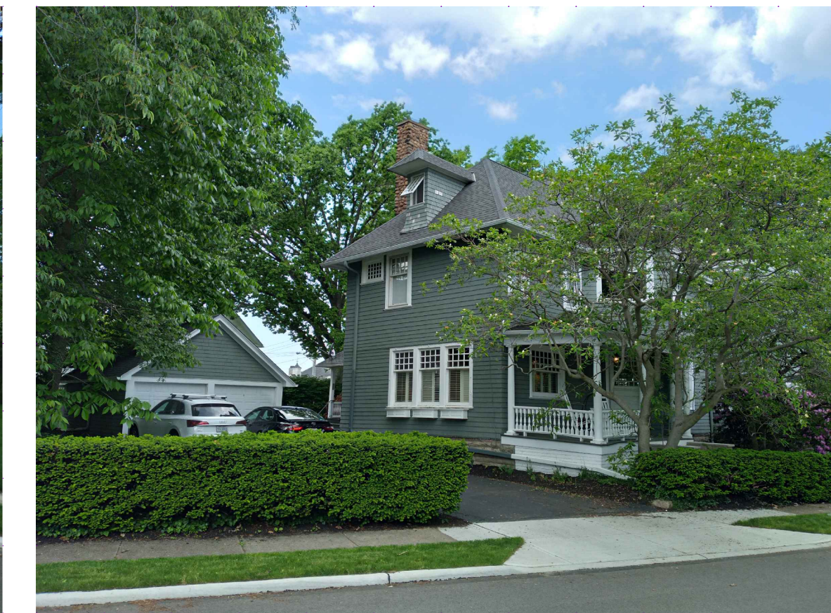
Neighbor to North