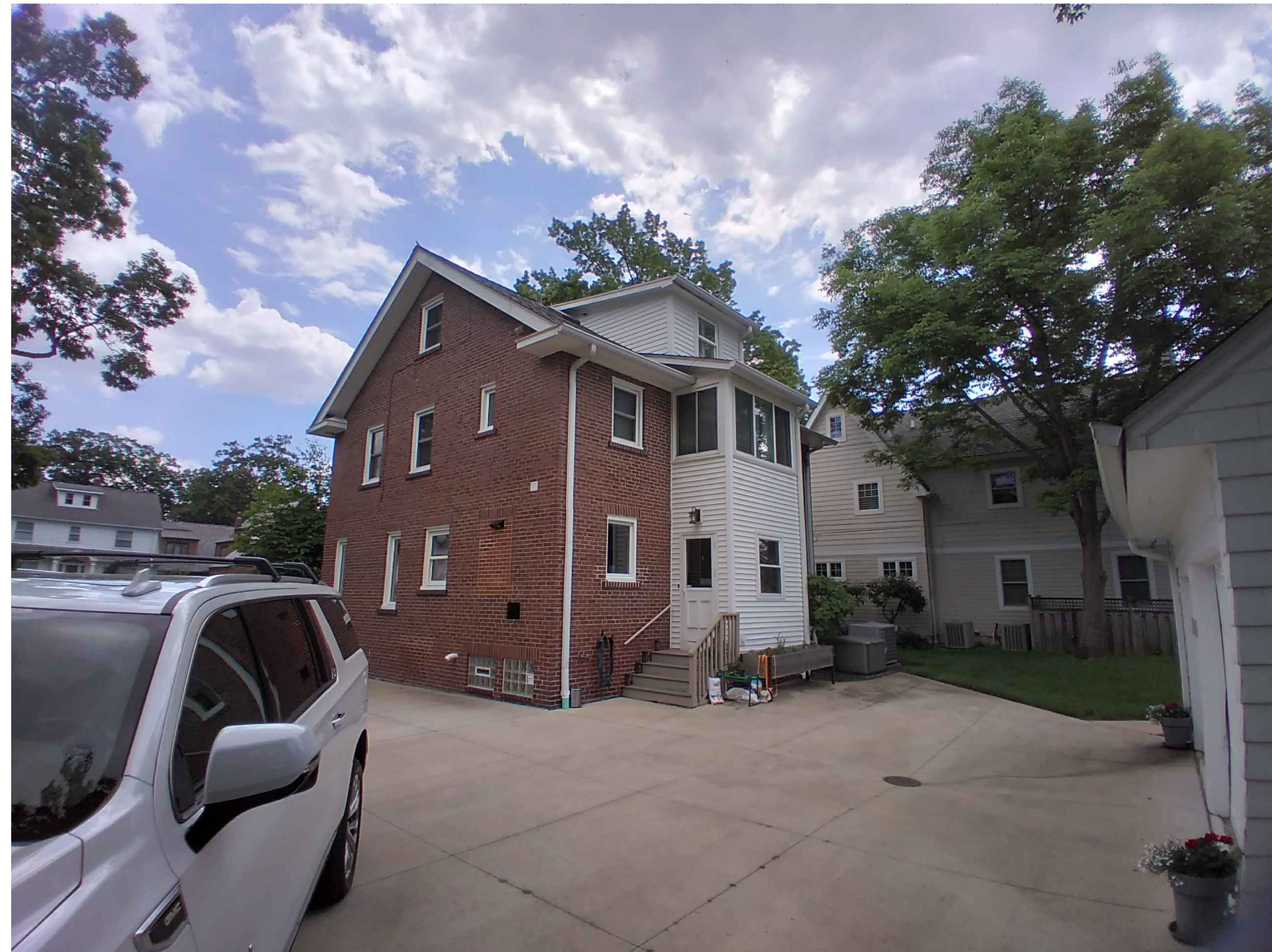
Rear Elevation (Existing)