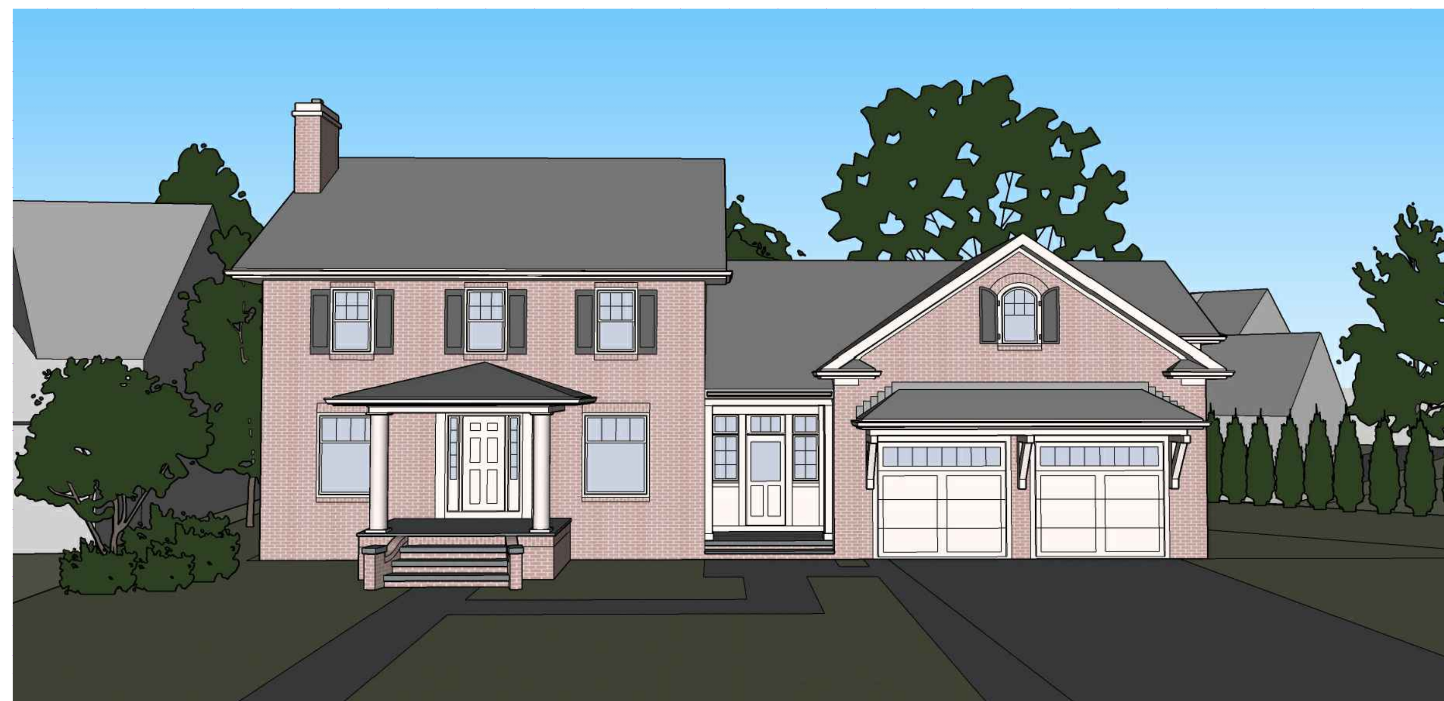
Front Elevation (Proposed)