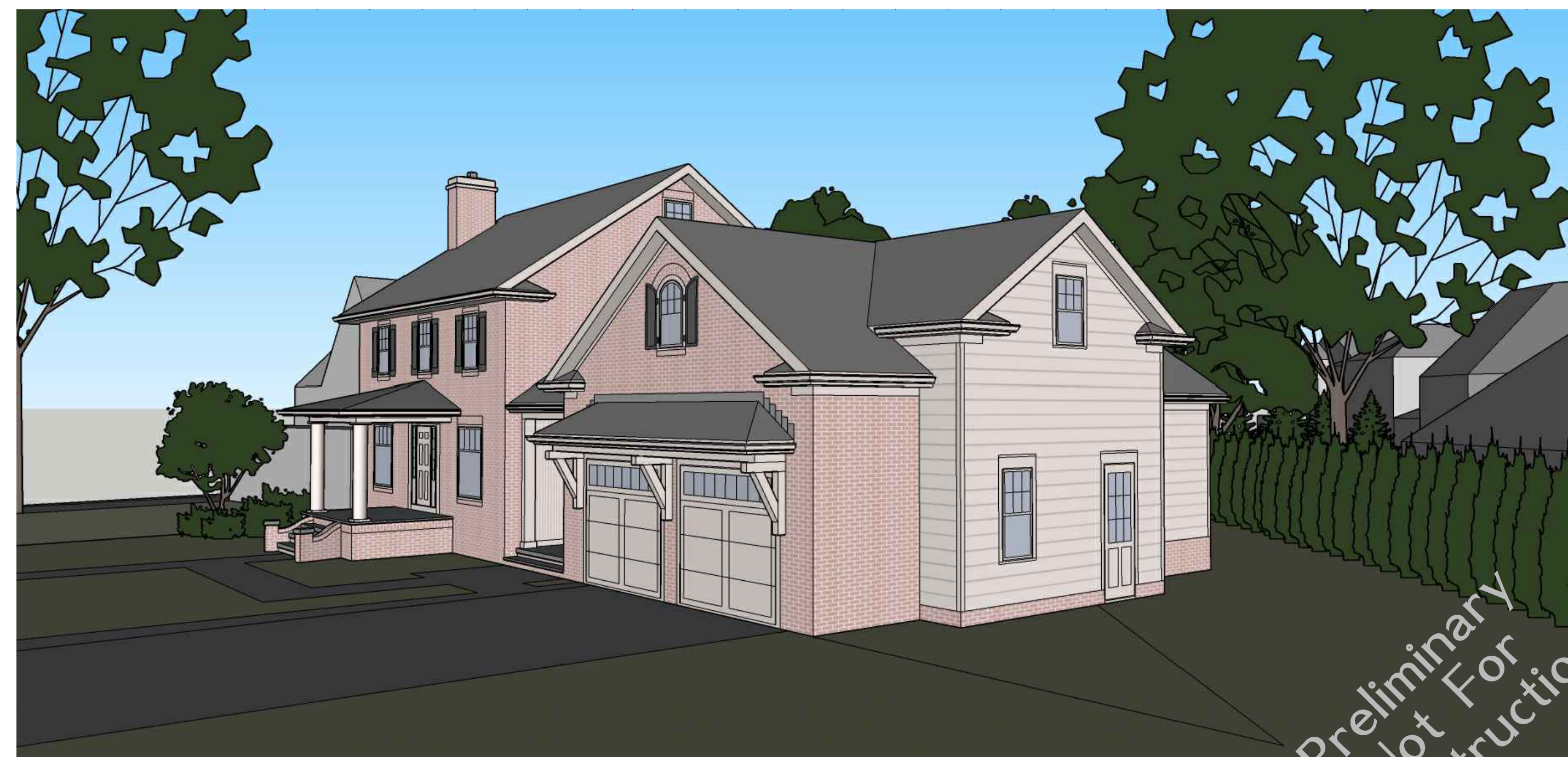
Garage Approach (Proposed)