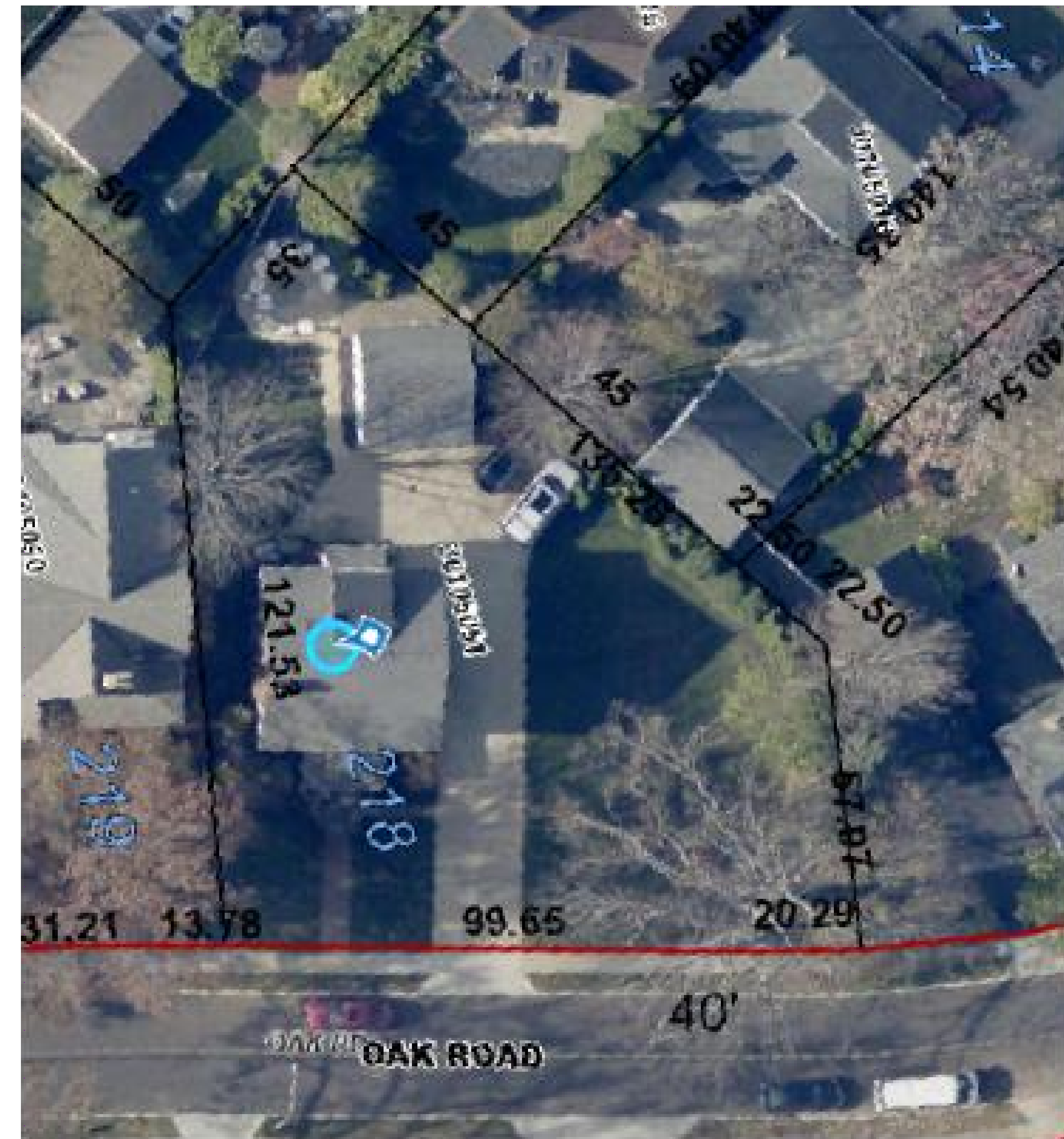
Site Satellite Image NOT TO SCALE