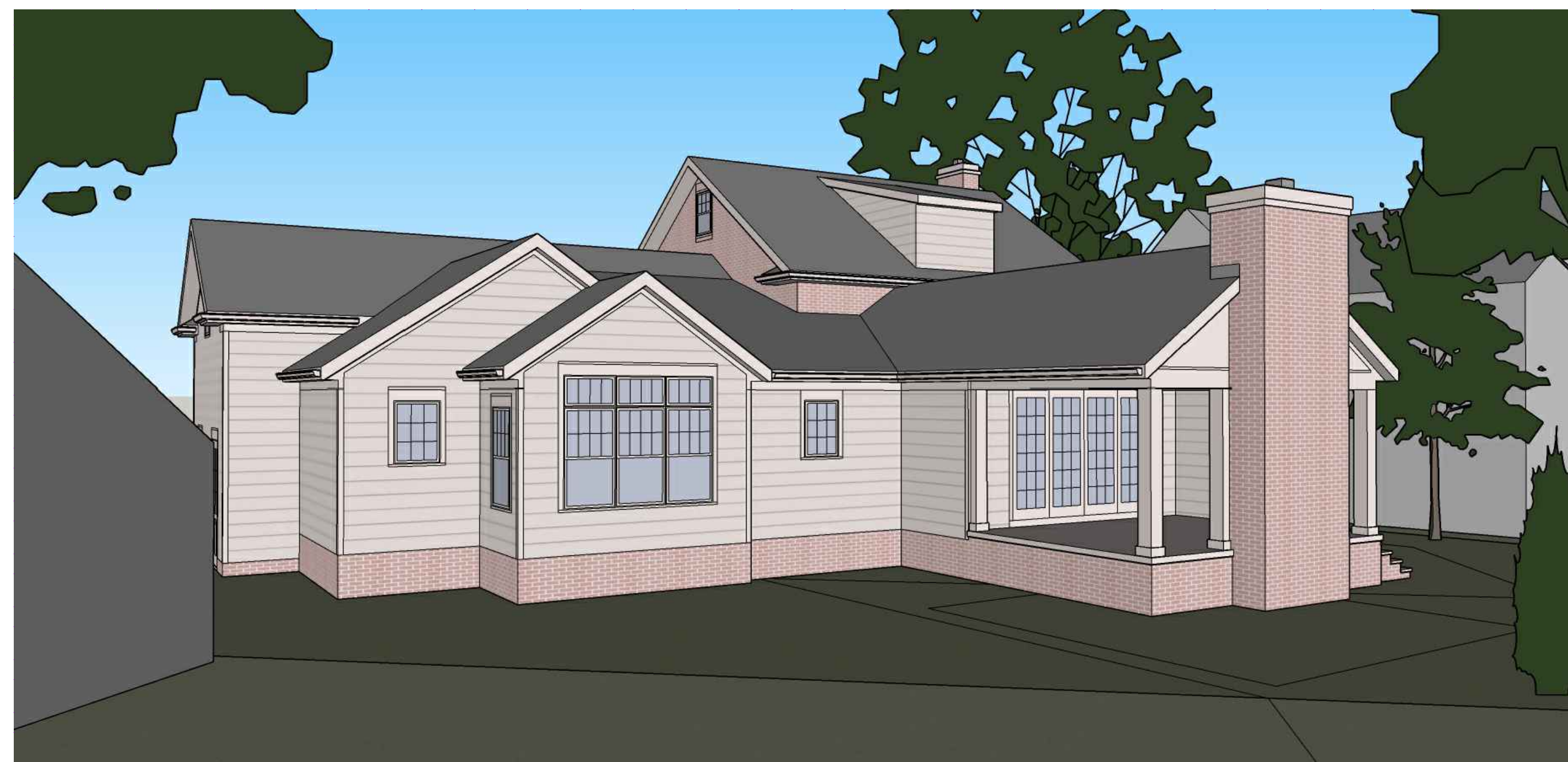
Rear Elevation (Proposed)