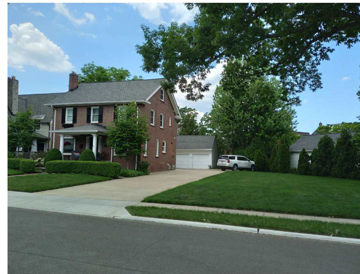
Existing House & Lot