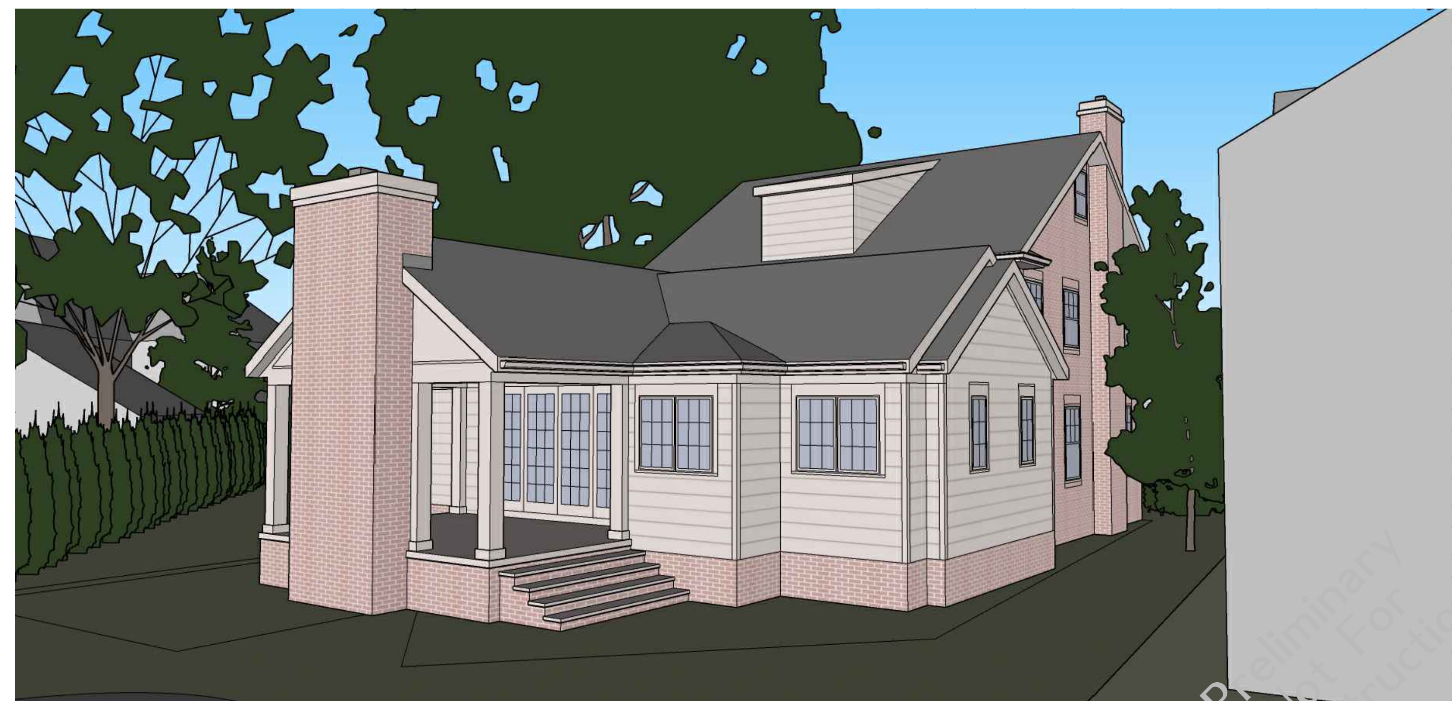
Patio Area (Proposed)