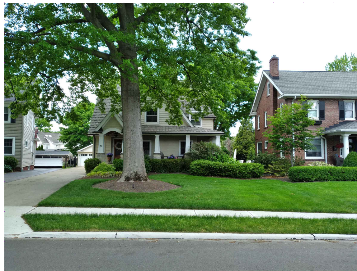
Neighbor to South