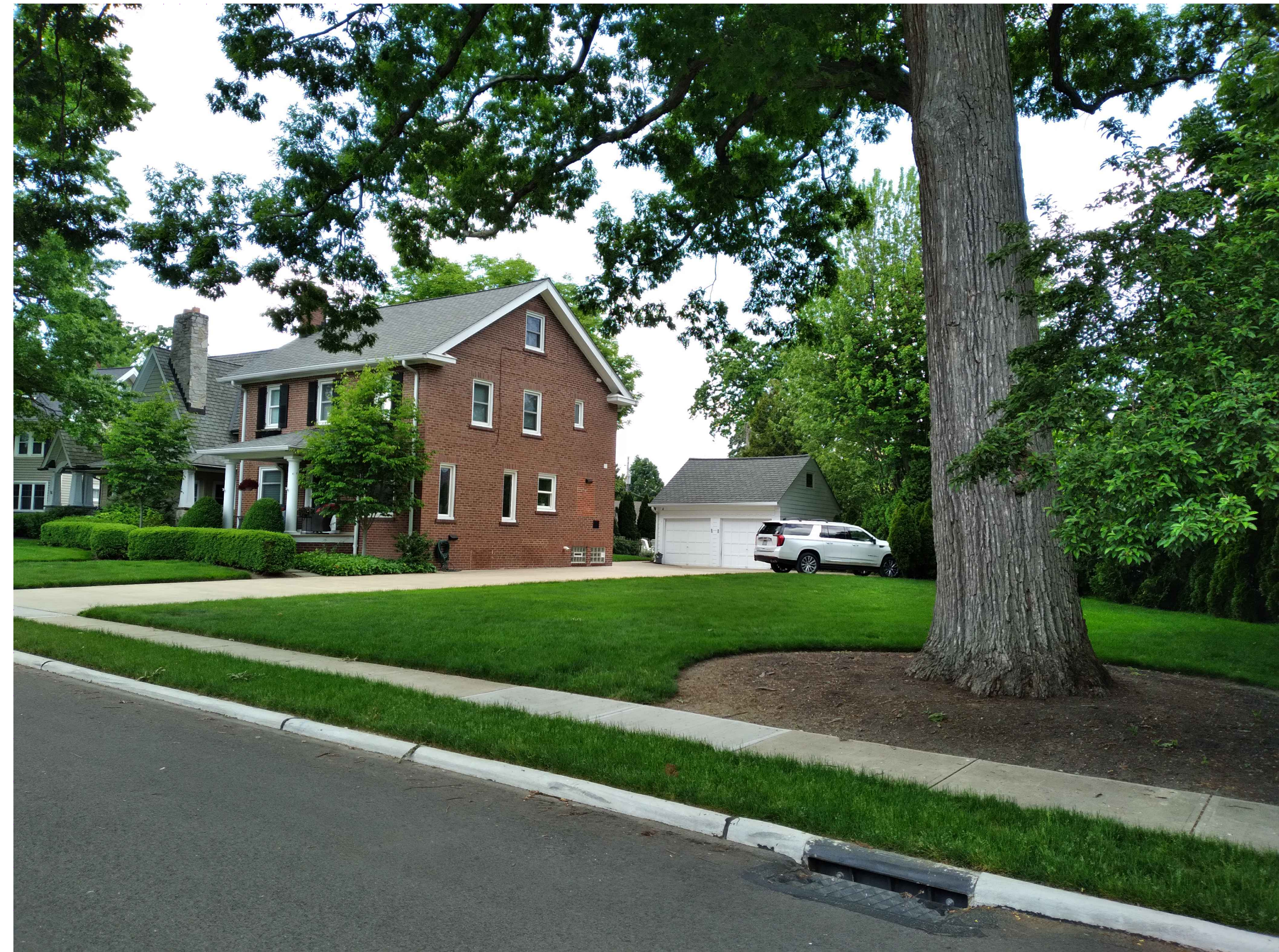
Garage Approach (Existing)