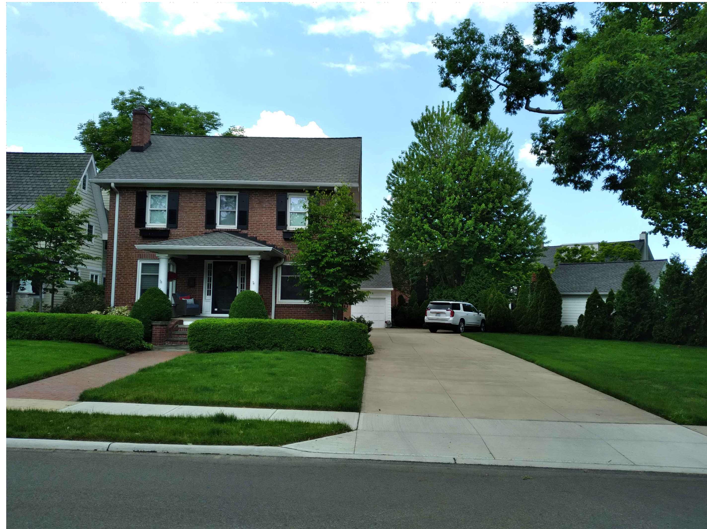
Front Elevation (Existing)