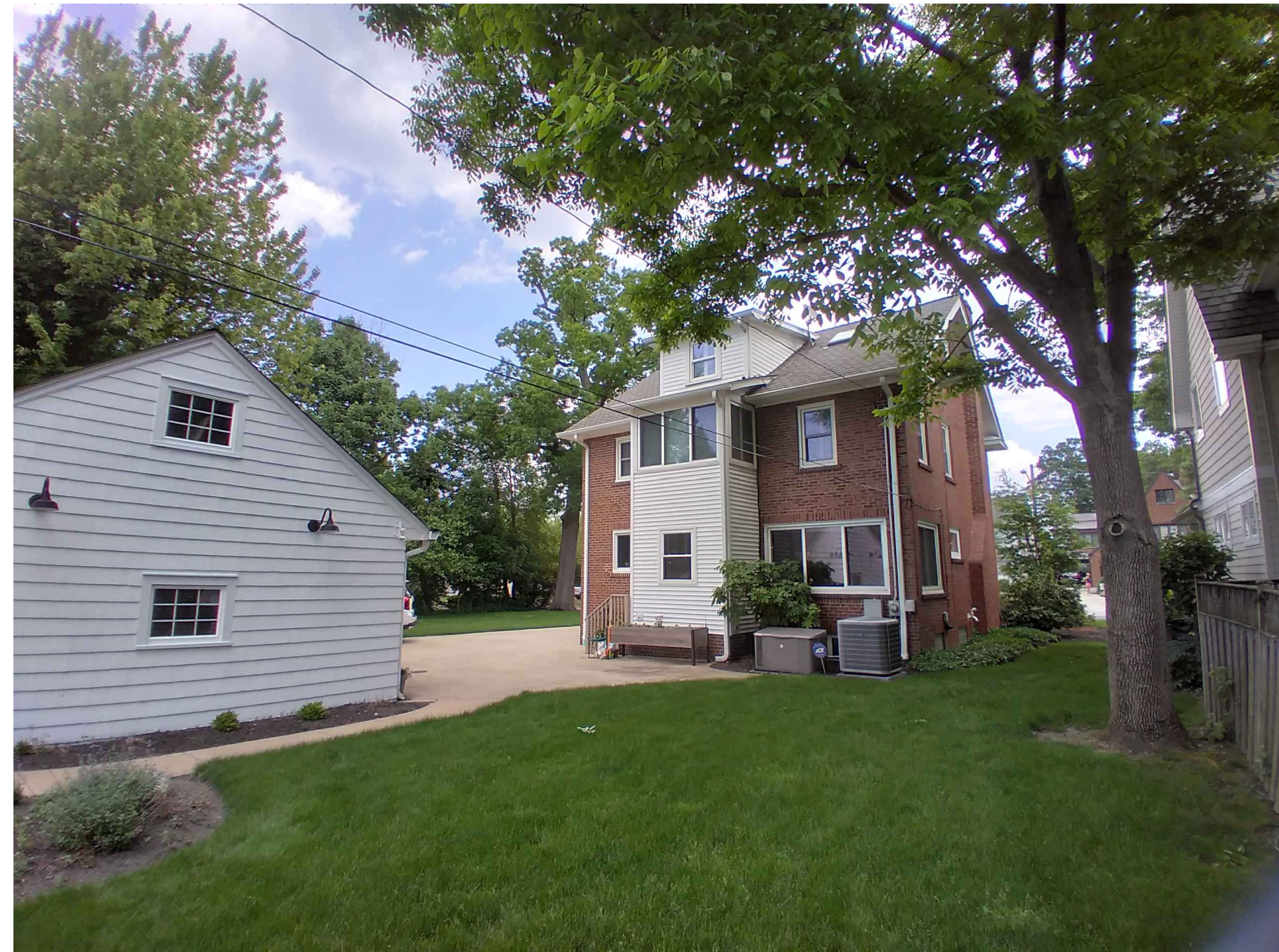
Patio Area (Existing)