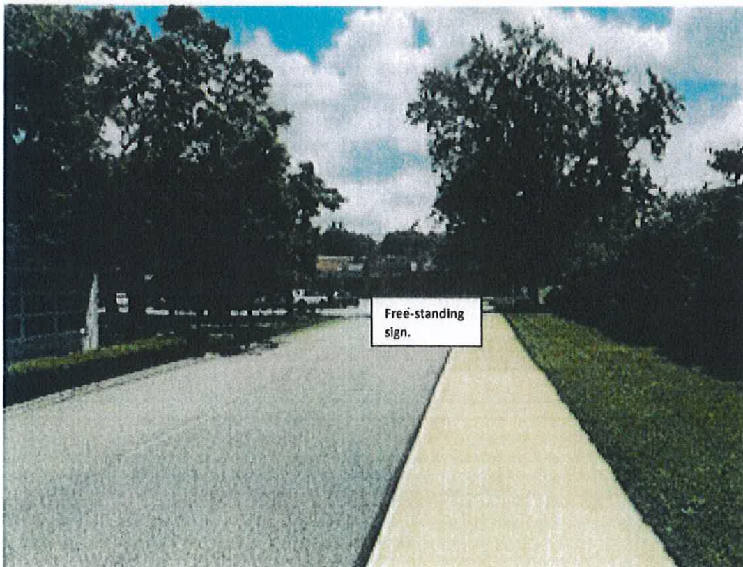
View from Orchard Park Drive.