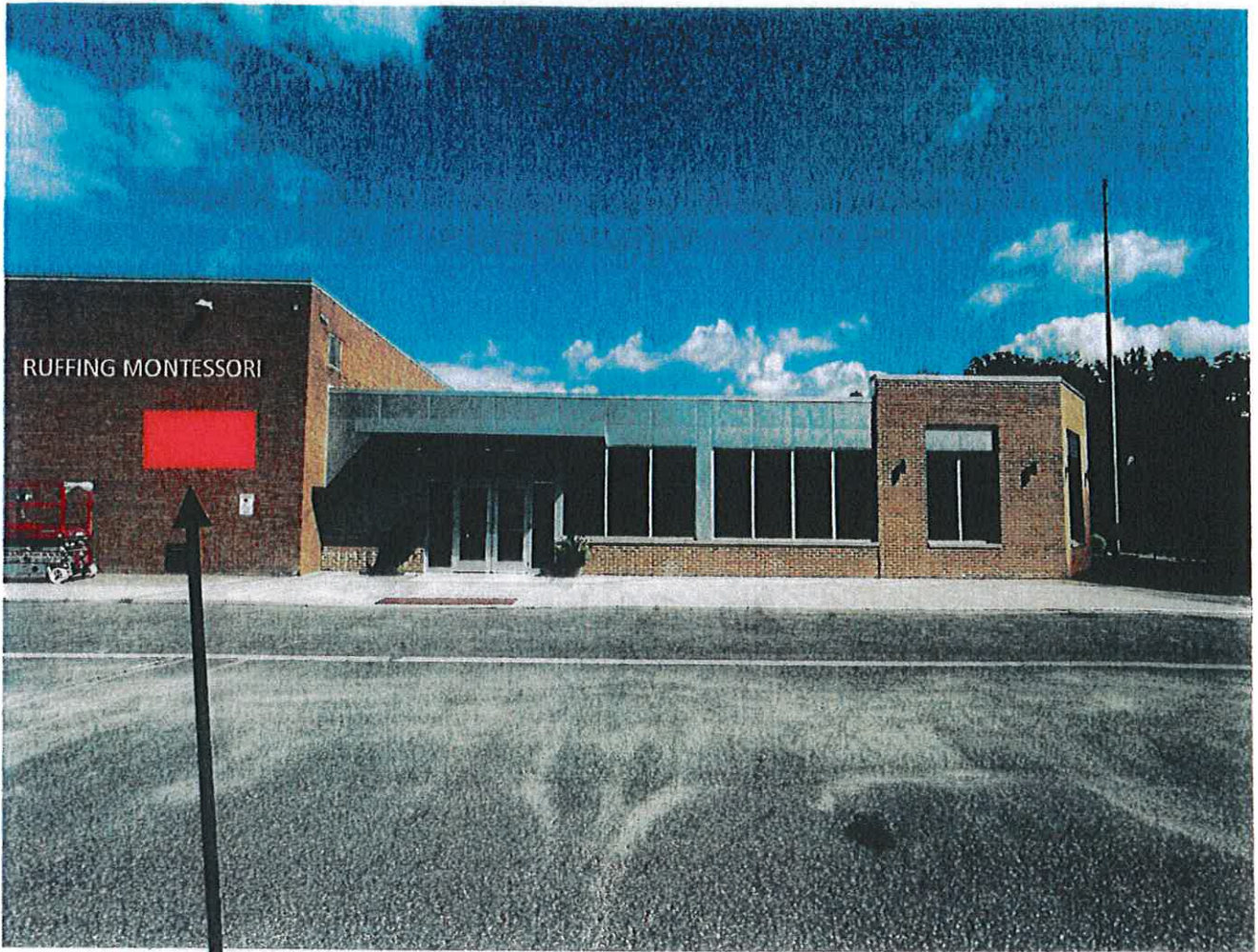
Proposed location of sign