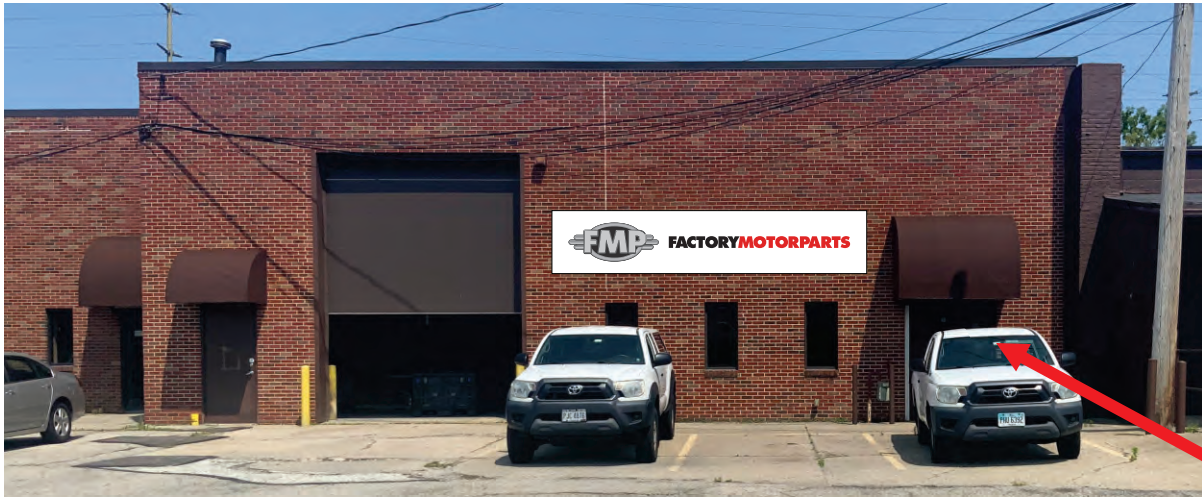
FRONT ELEVATION - PROPOSED