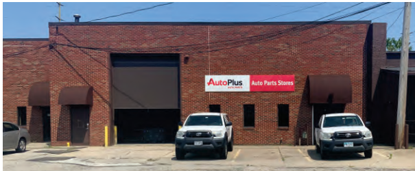
FRONT ELEVATION - EXISTING

REMOVE ALL EXISTING PANEL SIGNAGE, DISPOSE AND TEMP BANNER.