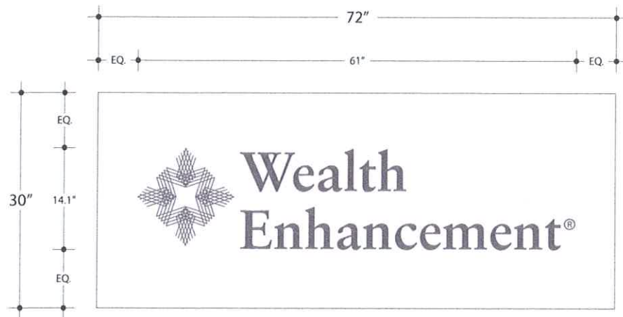
Cabinet Sign Panel - Front View - Scale @ 1" = 1'-0"