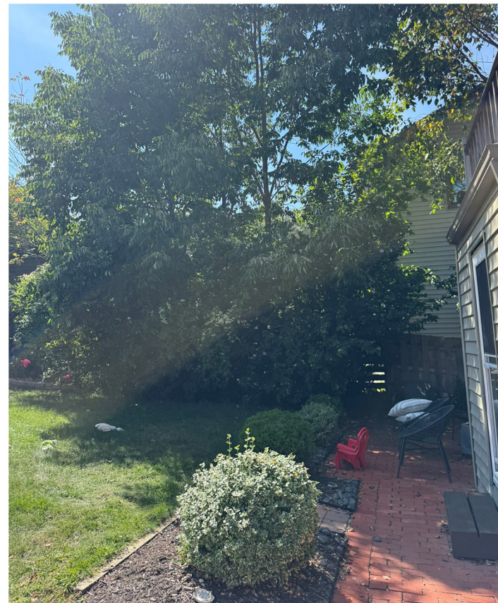
LOCATION OF ADDITION