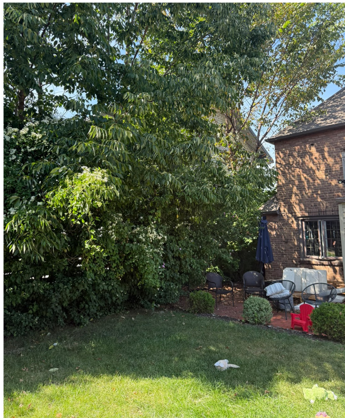
LOCATION OF ADDITION