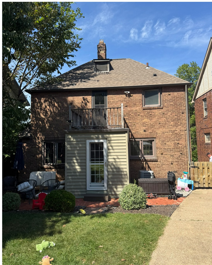
REAR OF HOME (EXISTING SMALL ADDITION TO BE DEMOLISHED)