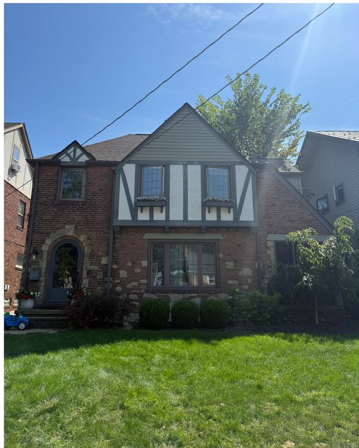
FRONT OF HOME