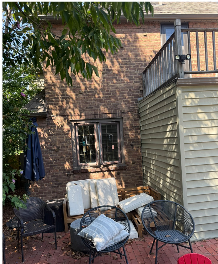
LOCATION OF ADDITION