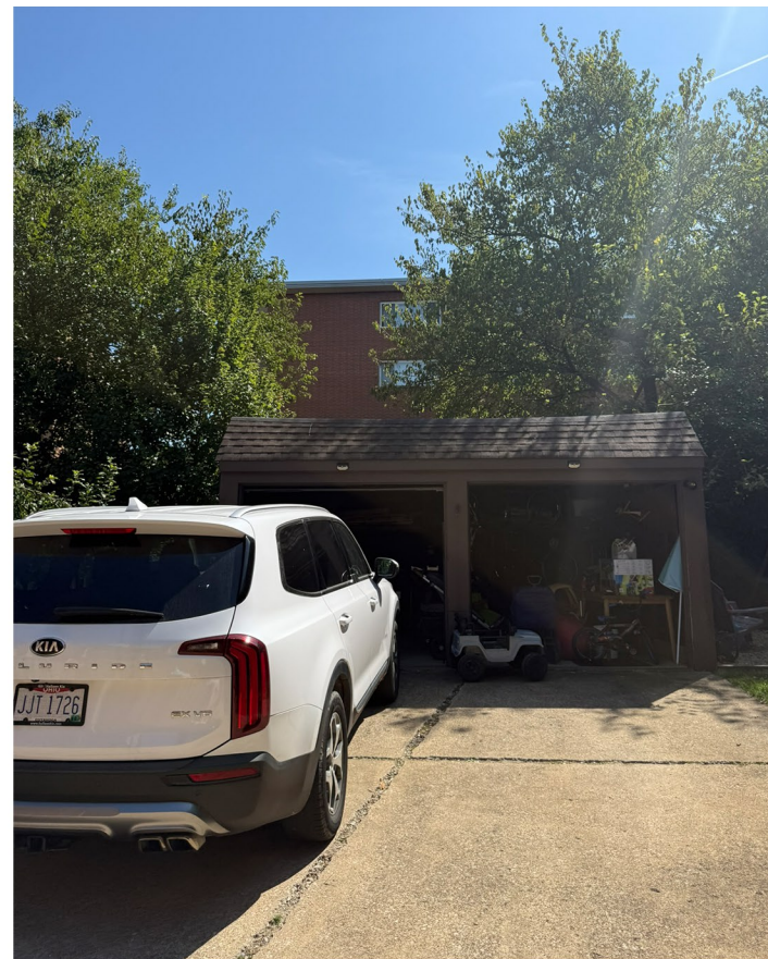
DETACHED GARAGE WITH APARTMENTS BEHIND