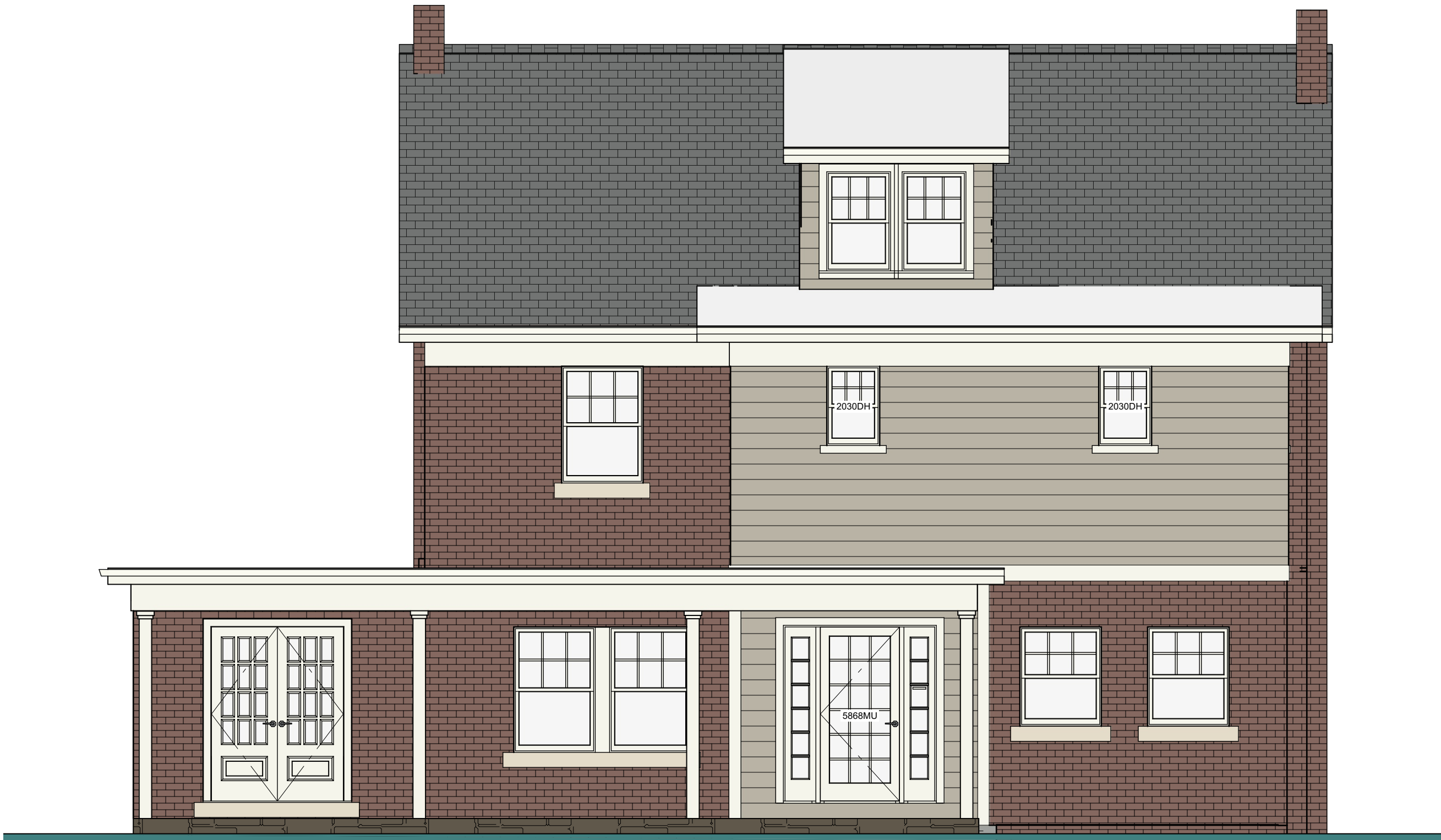
EAST ELEVATION 1/4" = 1'-0"

REVISIONS: 03.08.26: NEW CONCEPT 1 REV. PER COMMENTS 03.09.26: NEW CONCEPT 1 REV. REAR DOOR, # SDLTS 04.14.26: REVISIONS PER DESIGN REVIEW BOARD COMMENTS