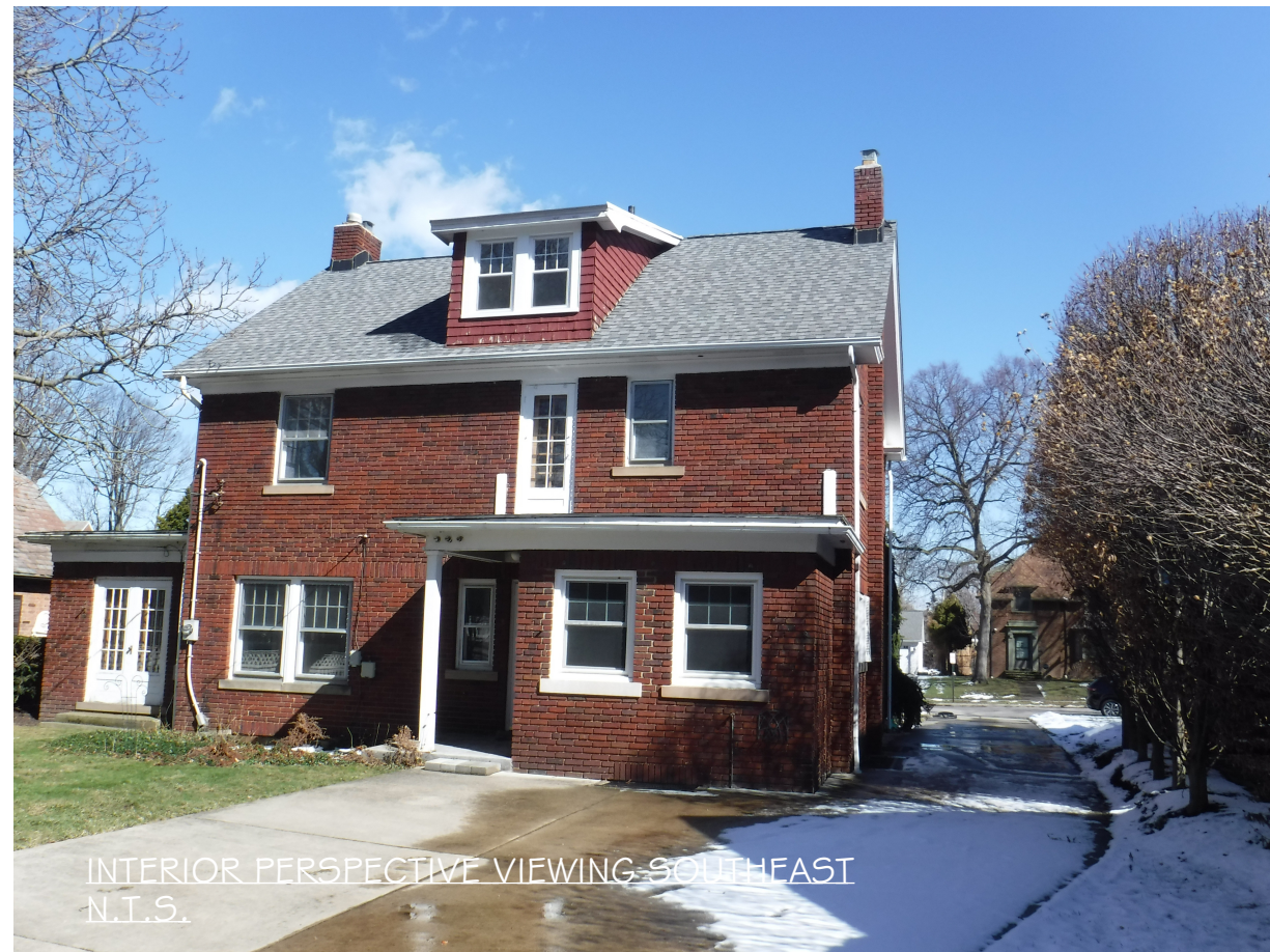
INTERIOR PERSPECTIVE VIEWING SOUTHEAST N.T.S.

REVISIONS: 03.08.26: NEW CONCEPT 1 REV. PER COMMENTS 03.09.26: NEW CONCEPT 1 REV. REAR DOOR # SDLTS 04.14.26: REVISIONS PER DESIGN REVIEW BOARD COMMENTS