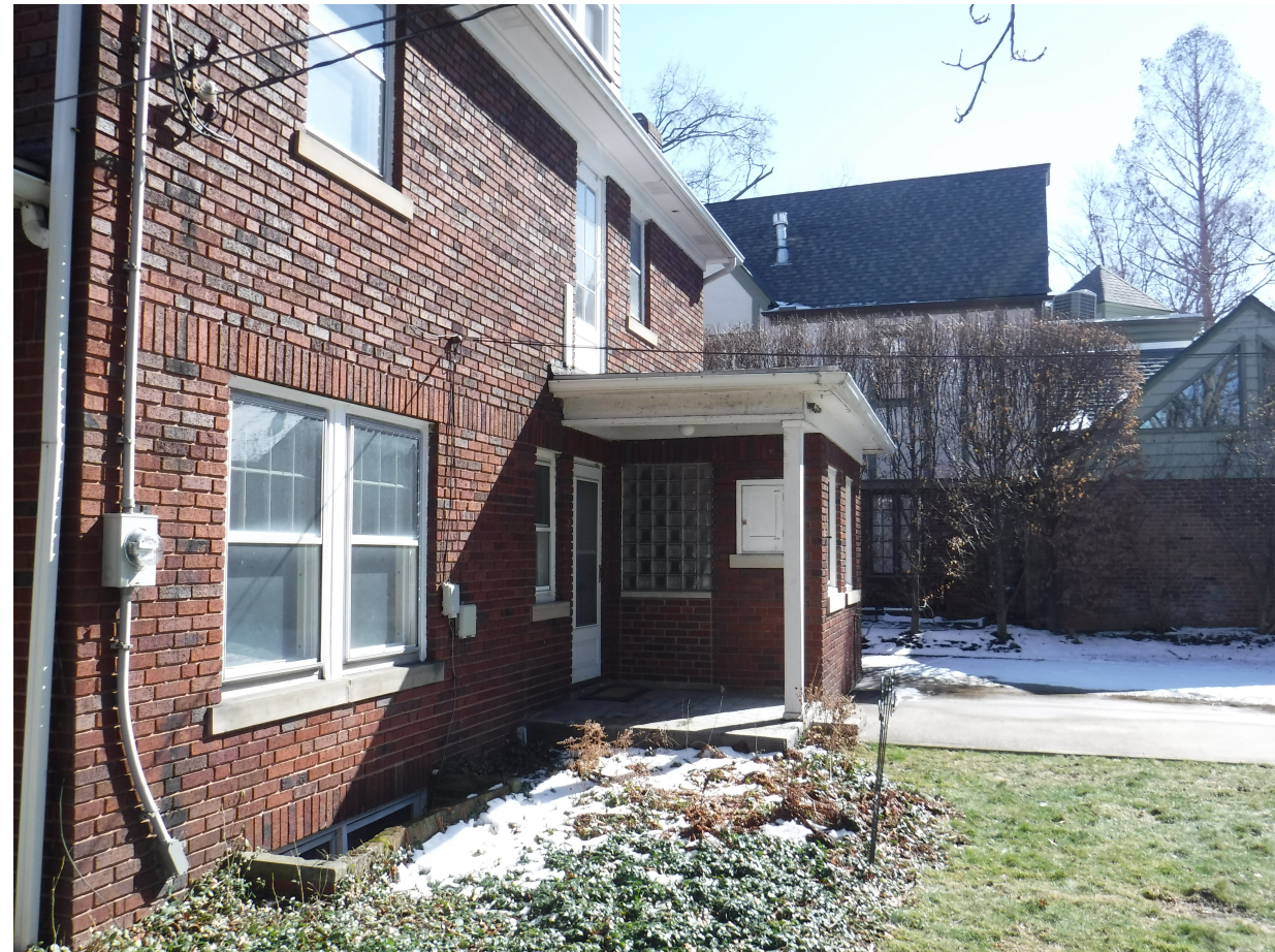
EXISTING CONDITIONS PHOTOGRAPHS