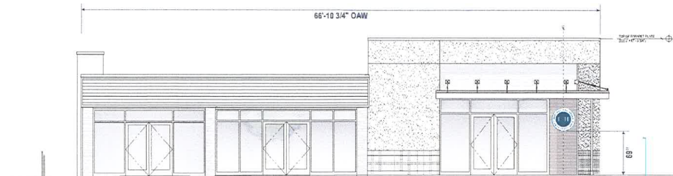
SOUTH ELEVATION 1/8" = 1'-0"