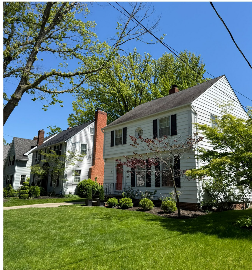
FRONT OF HOME