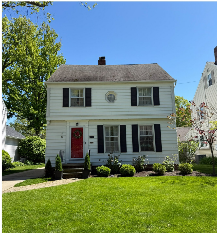
FRONT OF HOME