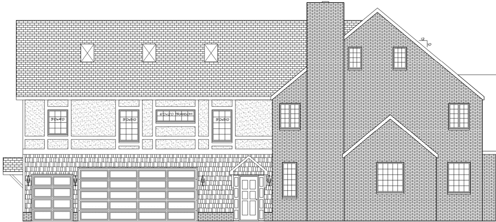
PROPOSED LEFT SIDE ELEVATION