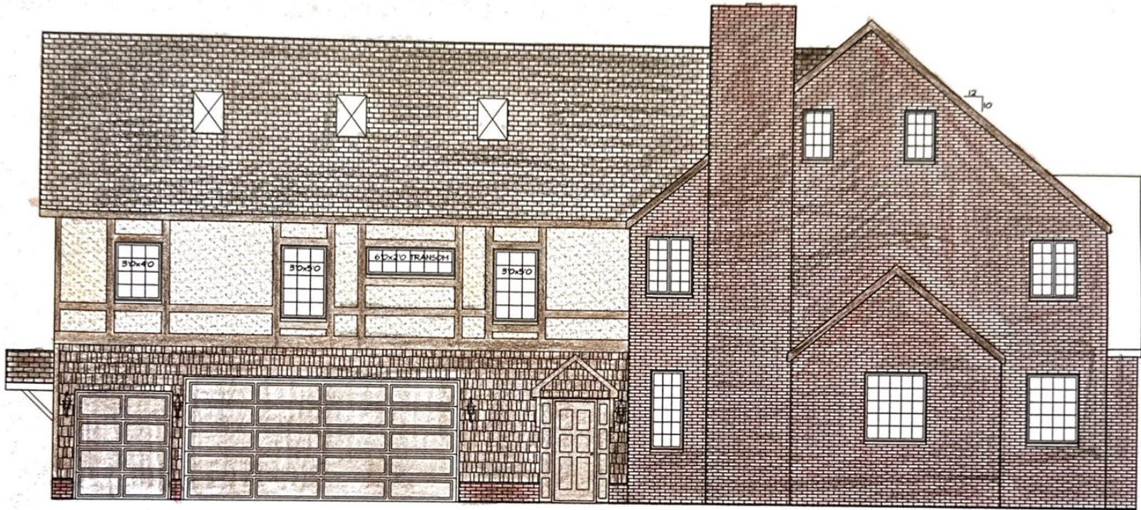
PROPOSED LEFT SIDE ELEVATION