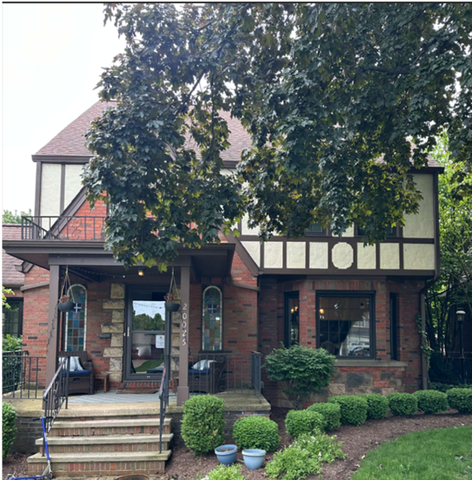
REFERENCE — EXISTING RESIDENCE (FRONT ELEVATION)

Material samples are James Hardie product references; brick is the standard deep red brick consistent with the existing construction.