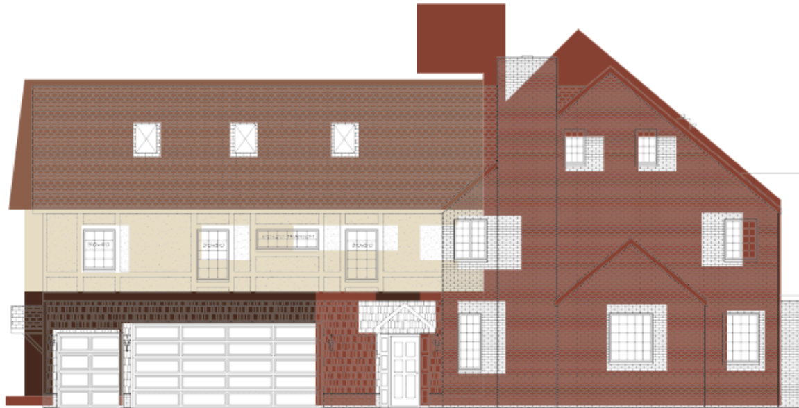
PROPOSED LEFT SIDE ELEVATION