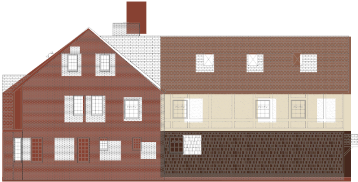
PROPOSED RIGHT SIDE ELEVATION