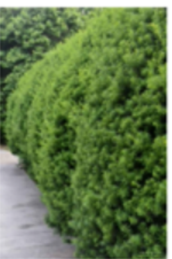
Hicks Yew Hedge