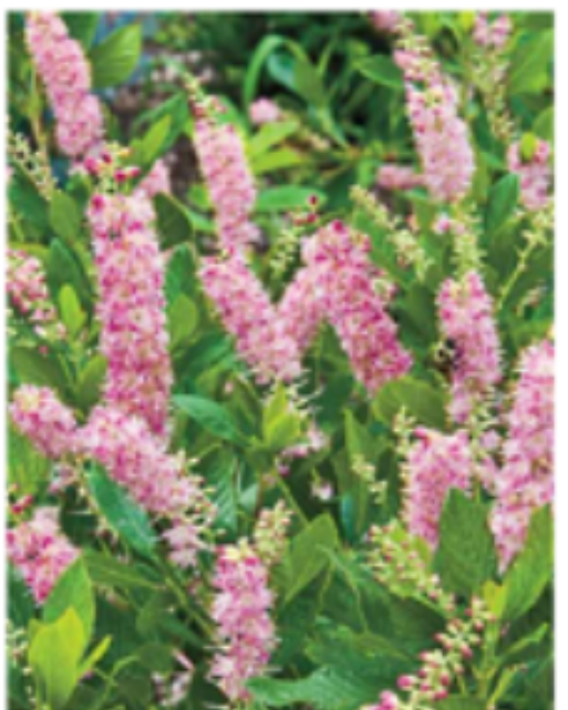
Ruby Spice Summersweet