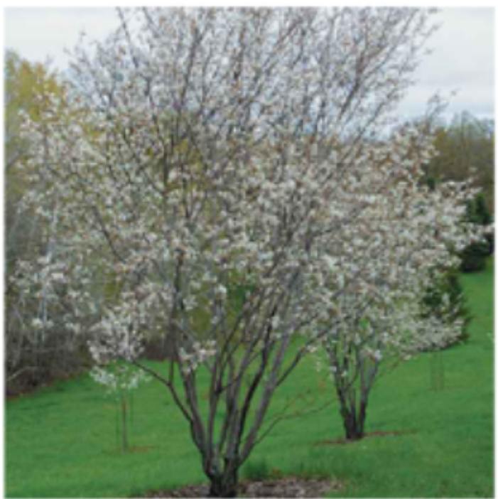
Autumn Brilliance Apple Serviceberry