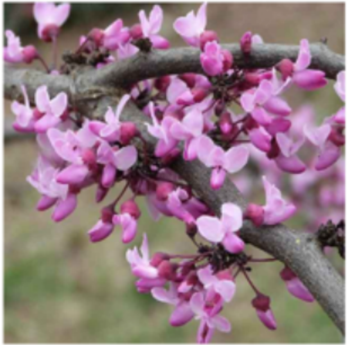
Northern Herald® Eastern Redbud