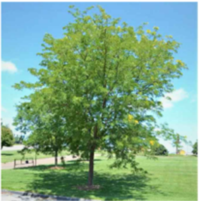
Skyline Honey Locust