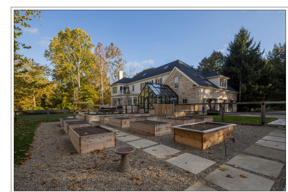
RAISED PLANT BED IMAGE